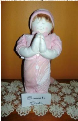
Saved to Death