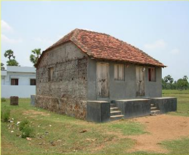
First school house in 2005 began with 5 students