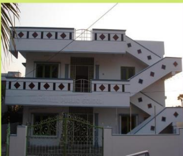
New school completed in 2008