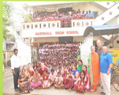
After several additions, Marshall School in 2017 educating 450 students!