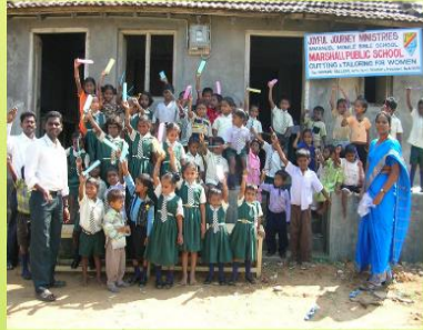
Outgrowing our space by 2007