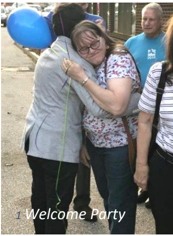
1 Welcome Party