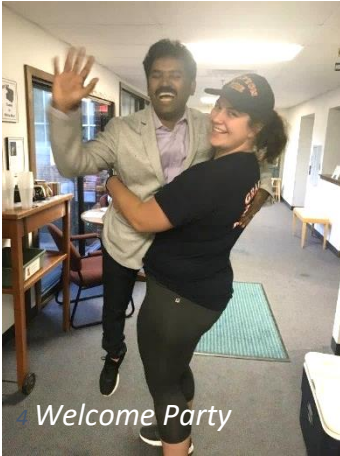
4 Welcome Party