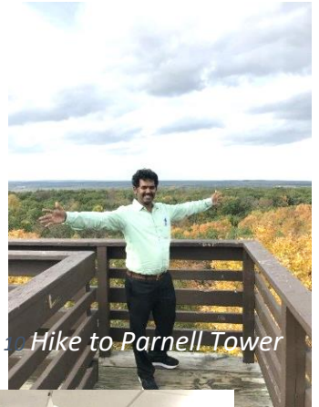
10 Hike to Parnell Tower