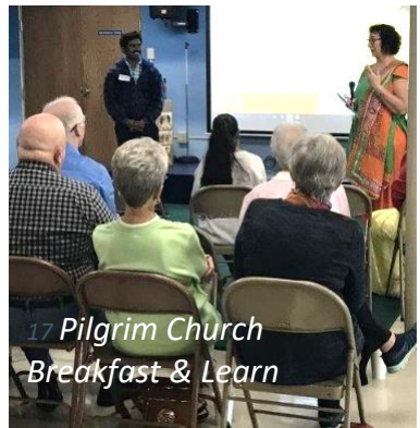
17 Pilgrim Church Breakfast & Learn