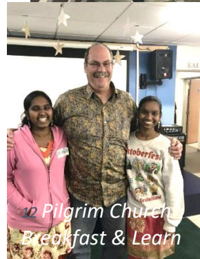
12 Pilgrim Church Breakfast & Learn