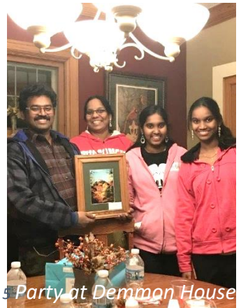
5 Party at Demmon House