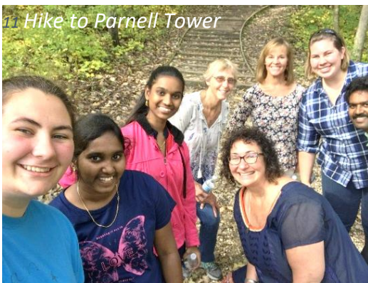
11 Hike to Parnell Tower