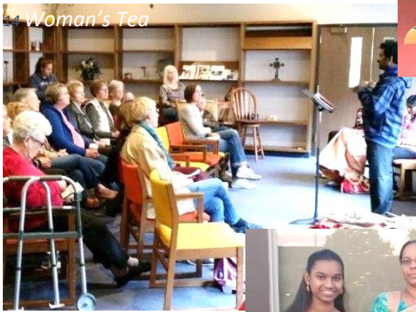
14 Woman's Tea