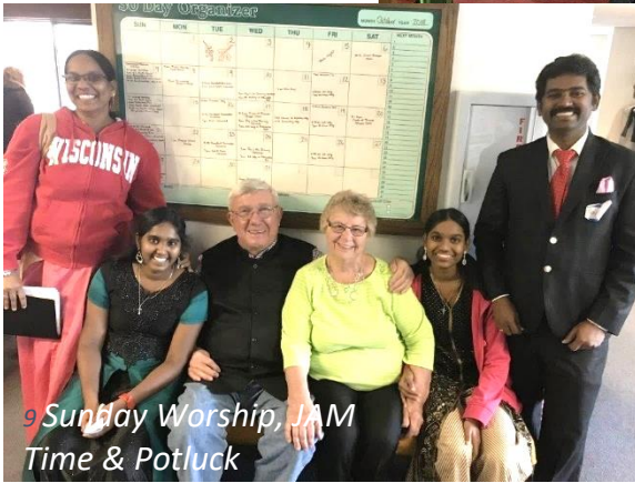
9 Sunday Worship, JAM Time & Potluck