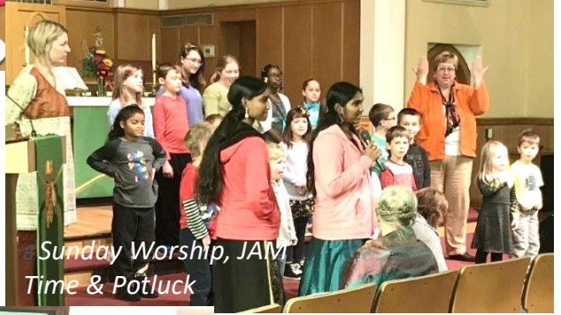
8 Sunday Worship, JAM Time & Potluck