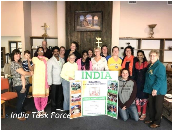
6 India Task Force