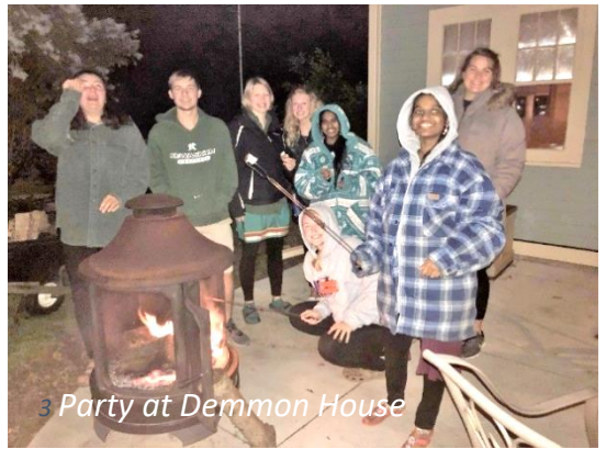
3 Party at Demmon House