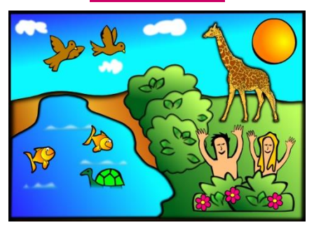
Genesis 1:1-2:3 "And God saw that it was good."